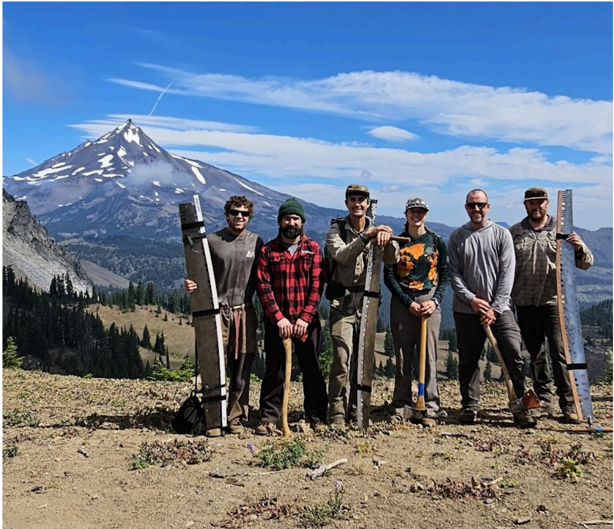
Crew photo on PCT in the Jefferson Wilderness

Throughout August, our Crew has been actively navigating every corner of the forest, making significant strides on the priority projects we set out to accomplish. From the Deschutes River Trail (DRT) to the Three Sisters Wilderness, the Jefferson Wilderness, Crescent District, and even to the summit of Mt. Bachelor, we've covered some incredible ground!