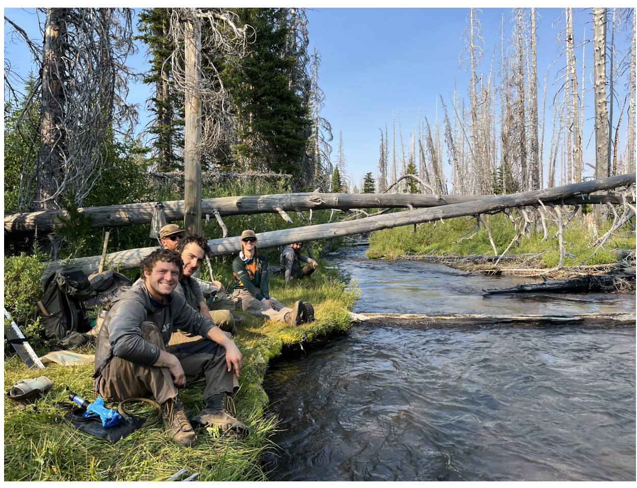
Crew getting water after long day crosscutting on Green Lakes Trail