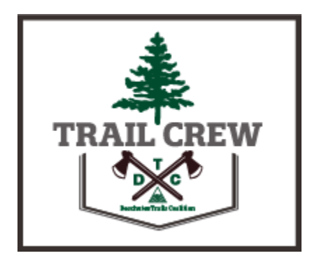
Deschutes Trails Coalition Bend, OR